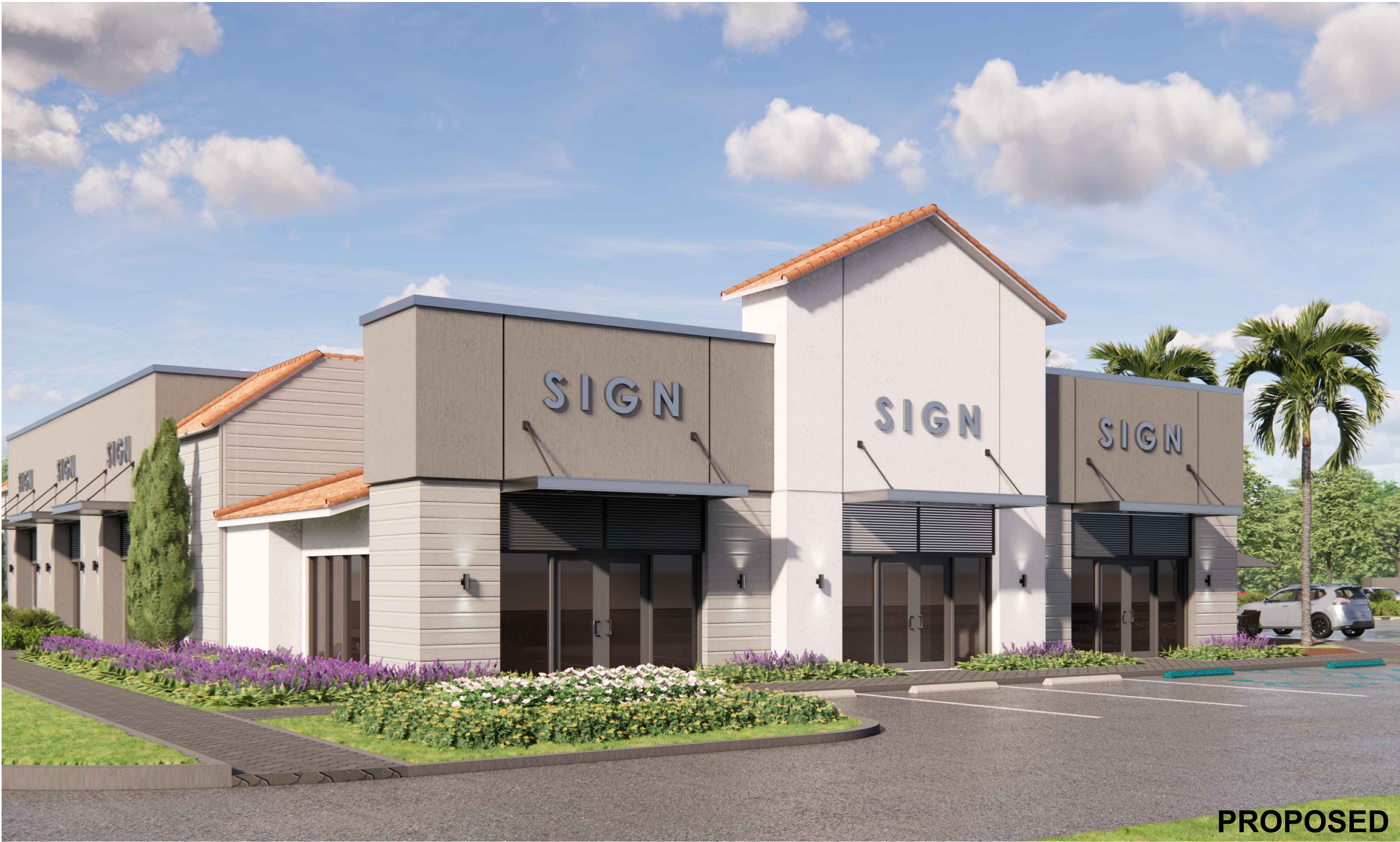
EXISTING BUILDING NORTHWEST PROPOSED VIEW (REFERENCE ONLY)