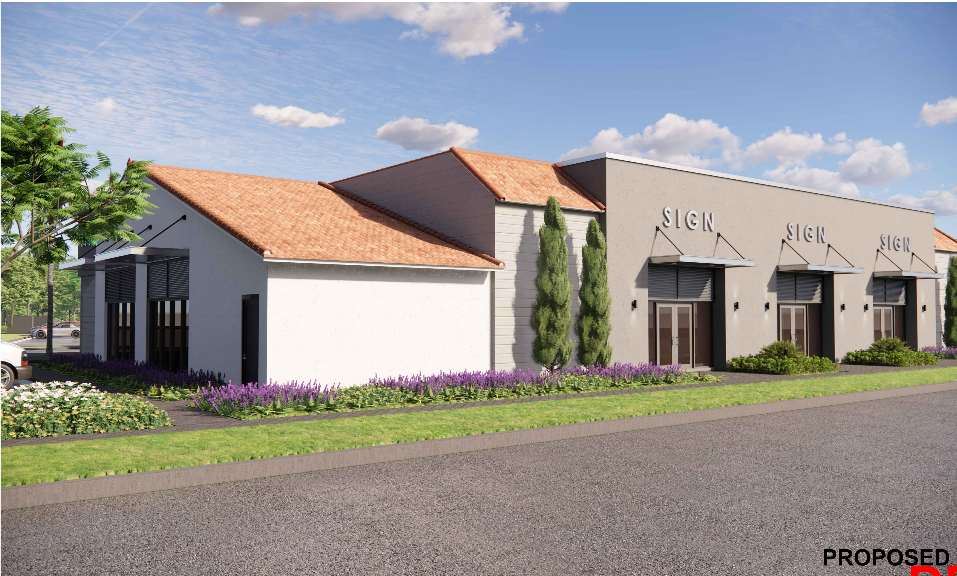
EXISTING BUILDING SOUTHWEST PROPOSED VIEW (REFERENCE ONLY)